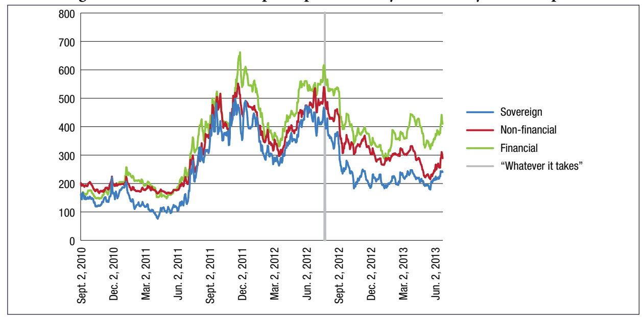
Figure 2b: Credit default swap risk premia on 5 year bonds by sector - Spain

Note: The non-financial and financial series refer to the unweighted average of bonds by the five largest financial and non-financial corporations in the country.